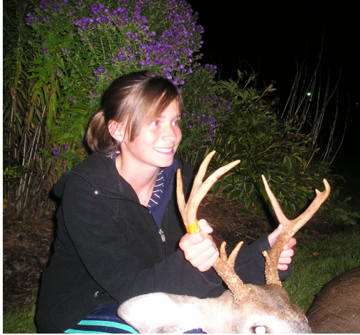
Just look at the size of her rack! Holy hell Batman! Amazing!

What is Doe Season, you ask? Why, look around you! Those wide eyed freshman girls are ripe for the taking, and there aren't enough for everyone. Now, you may have a few questions, such as "How can I tell if a girl is a freshman?" or "Is there a way I can tell if there are any Does left for me?" or "Why the hell is a chick the one writing this article?" Anyhow, I'll provide you with your very own field guide of finding these elusive single girls on campus: