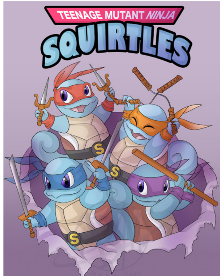
Coming soon to a TV near you! Be ready for a jet of shirikens when Squirtle uses ninja surf!

Have fun with Doe Season, as it is short lived. Good luck to those in the hunt, and be aware, we know that's not a calculator in your pocket. 🌻